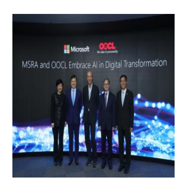
By Port Technology Team

Microsoft's research arm, Microsoft Research Asia (MSRA), and Orient Overseas Container Line (OOCL) have unveiled a collaboration aimed at integrating artificial intelligence (AI) research into the shipping industry.